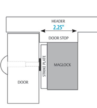
Fits in 2.25" of flat mounting space