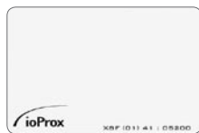
P20DYE Dye-Sub Card