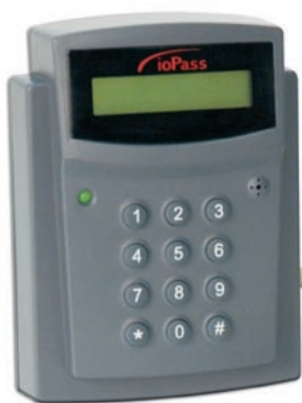
SA-600-EN *Reader and cards are not shown to scale.

SA-500-EN . . . . . Stand-alone controller with integrated proximity reader SA-600-EN . . . . . Stand-alone controller with external proximity reader SA-RM56 . . . . . Additional relay module P10SHL . . . . . Standard ioProx proximity card P20DYE . . . . . Thin ioProx proximity card, front/back surface glossy for Dye-Sub printing P30DMG . . . . . Dye-Sub card with mag stripe P40KEY . . . . . ioProx proximity keytag P50TAG . . . . . ioProx self-adhesive tag