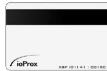
P30DMG Dye-Sub Card with Mag Stripe